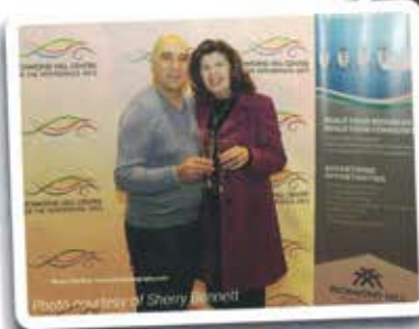
Richmond Hill Centre for the Performing Arts, to be held in the near future.

she ultimately founded an educational platform called Let's Talk Cannabis™. Her most recent lecture on medical cannabis education was held virtually on July 27, through the Richmond Hill Board of Trade. She is also gearing up for a series of live events featuring expert speakers at the